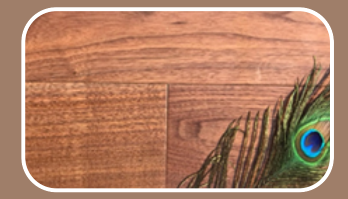
Walnut Walnut is a strong, hard and durable type of wood. It finishes well and has rich colors.