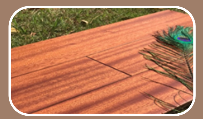
Sapele Sapele has a beautiful African heartwood and is notable for being highly resistant from parasites attack.