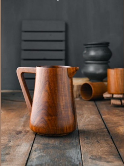
COLOR: NATURAL WOOD: TEAK WOOD SET OF: 1 PC CAPACITY: 1000 ML DIMENSIONS: GBJ1: 7.00 X 4.75 (INCH)