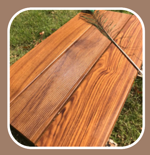
Burma Teak Deck