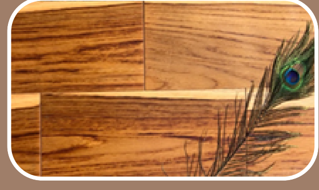
African Teak It is from big round logs and timber that has strong corrosion resistance in Indoor or outdoor conditions.

It is considered as one of the best wood flooring material with extraordinary high resistance to humidity, decay, bacteria & termite attack.