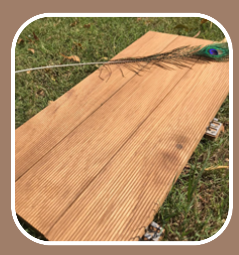
African Teak Deck